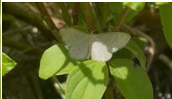
Silky wave moth