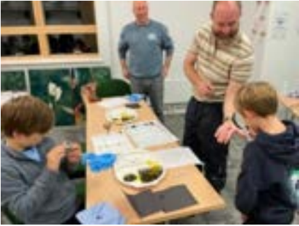
Winter tree identification