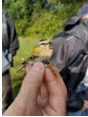
Ringing a firecrest