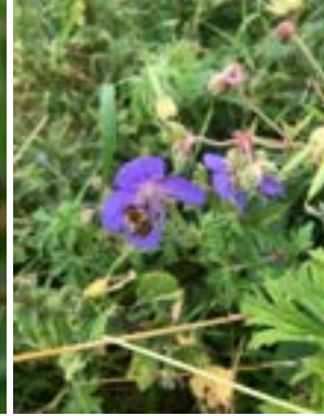
Common carder bee